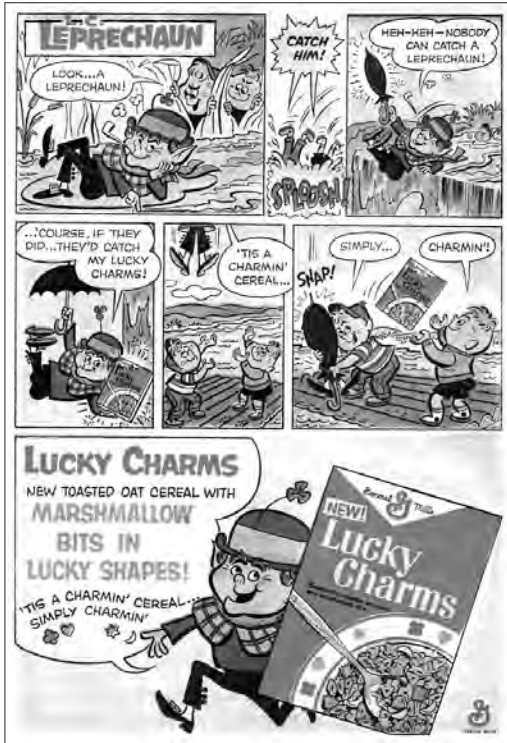
Cereal content: a comic book ad from 1964.

In the United States, the average “consumer” sees or hears hundreds of advertisements every day and from an early age learns to associate products with positive imagery and messages. Clearly, if advertising were not effective, businesses would not spend 1 percent of the gross world product to sell their wares, as they do. And they are right: studies have demonstrated that advertising indeed encourages certain behaviors and that children, who have difficulty distinguishing between advertising and content, are particularly susceptible. As one U.S. National Academy of Sciences panel found, “food and beverage marketing influences the preferences and purchase requests of children, influences consumption at least in the short term, is a likely contributor to less healthful diets, and may contribute to negative diet-related health outcomes and risks among